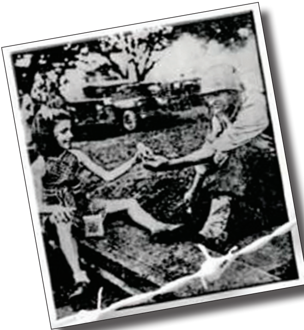
Freedom at last: American GI gives a Japanese doll to an emaciated nine year old outside the gates of Japanese internment camp.

THE TRUE STORY OF AN AMERICAN GIRL’S LIFE DURING WW II